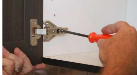
Back screw adjusts door in and out.